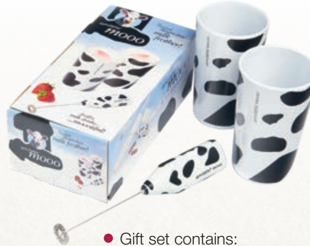
MOO GIFT SET AL-GS2-MOO