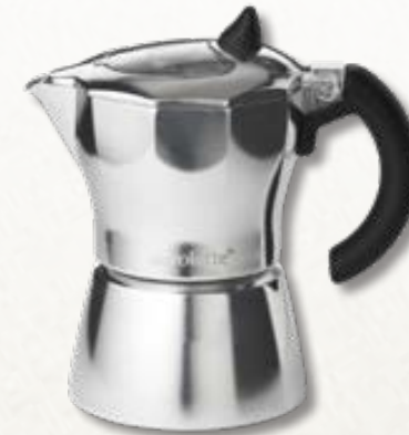
3-CUP MOKAVISTA MV-1-3AL