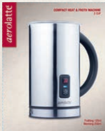
COMPACT GIFT BOX AC-1-PL