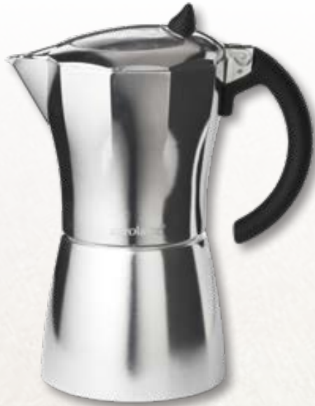
9-CUP MOKAVISTA MV-1-9AL