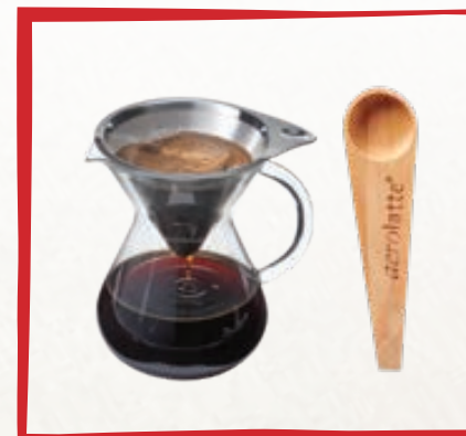
DRIP COFFEE BREWER WITH MICROFILTER AND COFFEE SCOOP & BAG CLIP