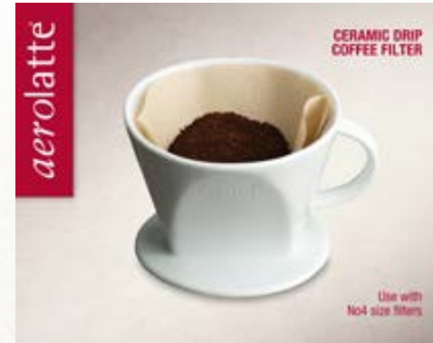
CERAMIC COFFEE FILTER CF-1-4WH