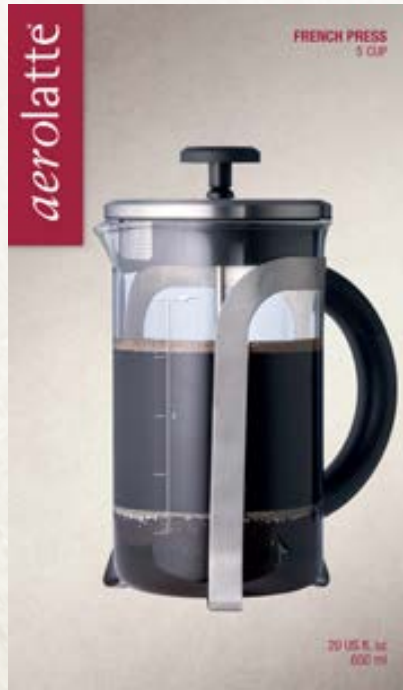
5-CUP FRENCH PRESS/CAFETIERE FP-1-5