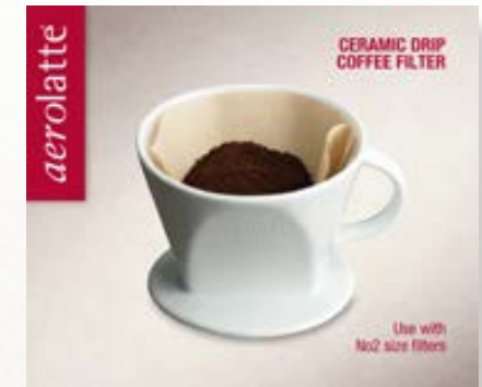
CERAMIC COFFEE FILTER CF-1-2WH