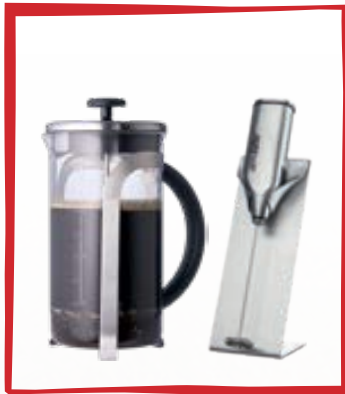
8 CUP FRENCH PRESS, DELUXE STAINLESS FROTHER WITH STAND