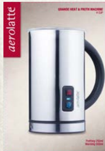
GRANDE GIFT BOX AG-1-PL