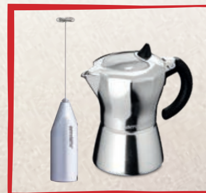
SATIN FROTHER AND 3 CUP MOKAVISTA