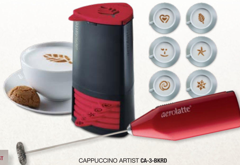
CAPPUCCINO ARTIST CA-3-BKRD