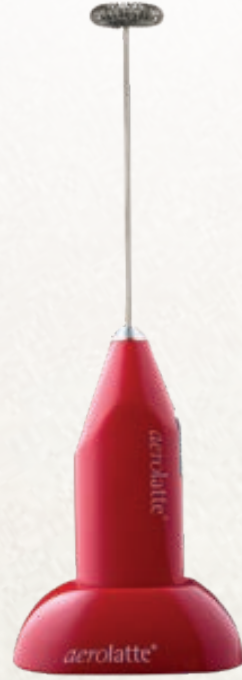
AL-ST4-RD GIFT BOX COUNTER DISPLAY OF 6