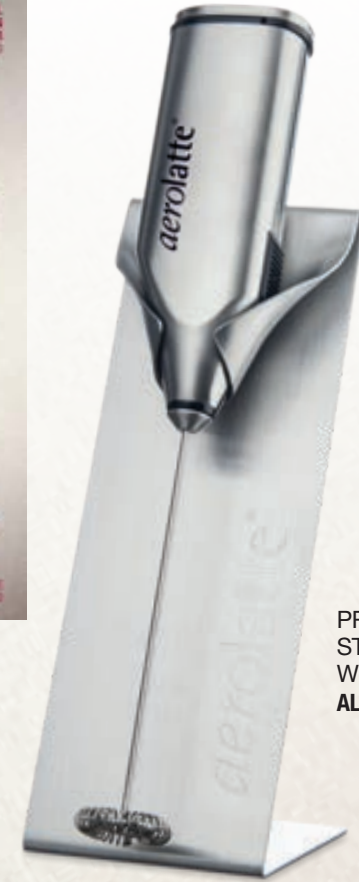
PROFESSIONAL STAINLESS STEEL WITH OR WITHOUT STAND AL-3-SS/AL-ST-SS