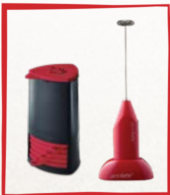
CAPPUCCINO ARTIST AND RED FROTHER IN STAND