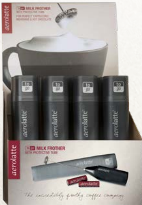
COUNTER DISPLAY OF 12