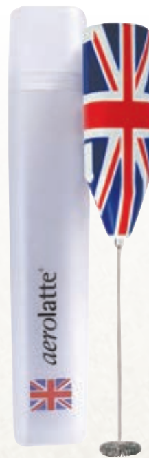
PROTECTIVE TUBE UNION JACK AL-TG-UF