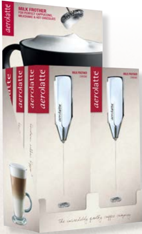
COUNTER DISPLAY OF 6