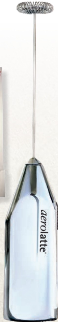
CLASSIC CHROME AL-3-CH