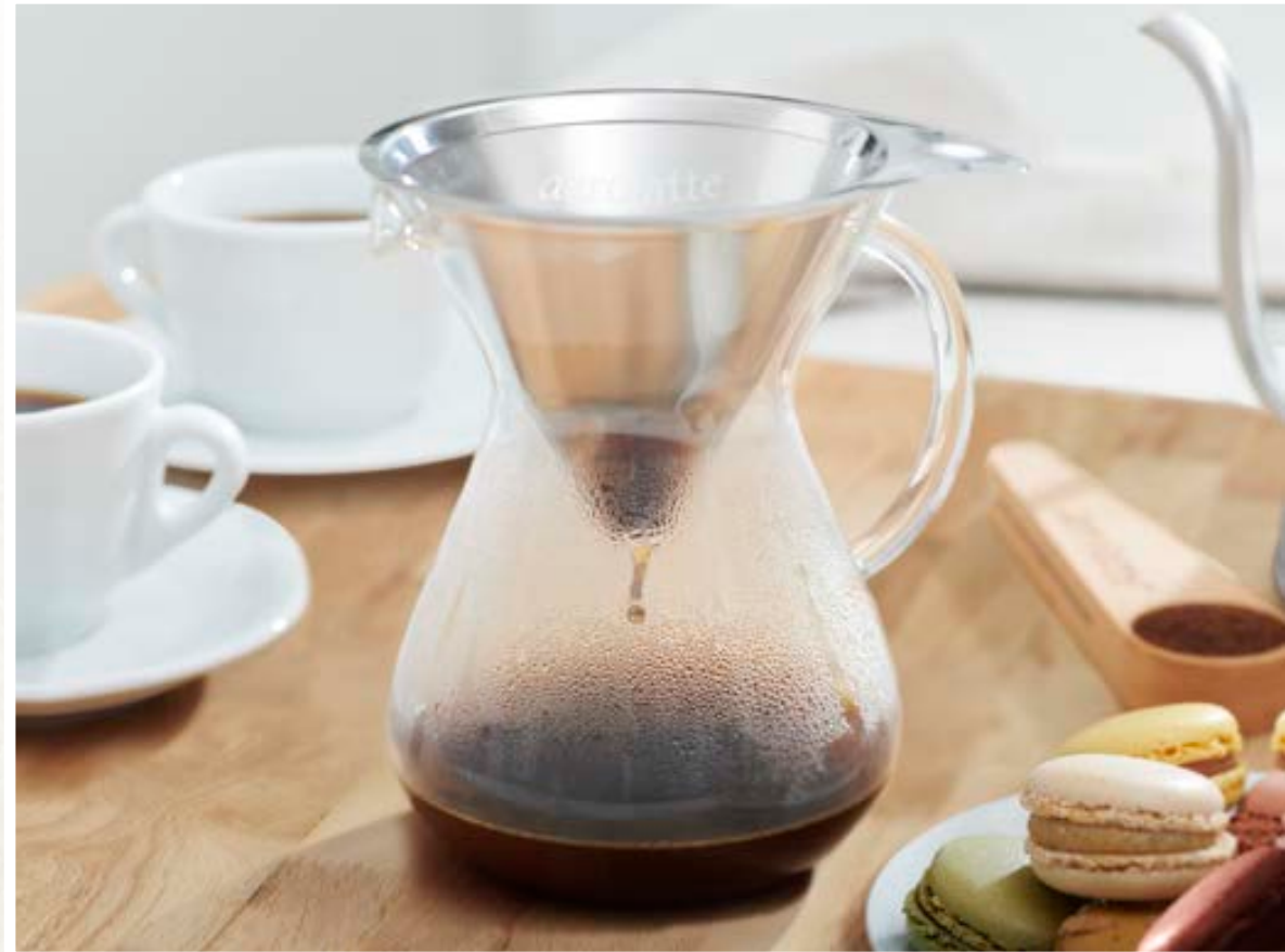
DRIP COFFEE BREWER WITH MICROFILTER CF-2-GS