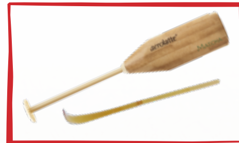
MATCHA TEA WHISK & SCOOP