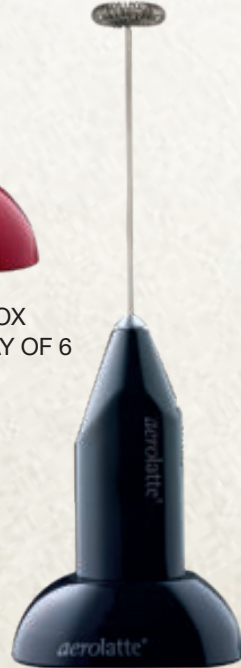
AL-ST4-BK GIFT BOX COUNTER DISPLAY OF 6