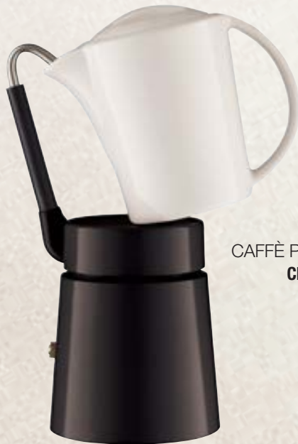
CAFFÈ PORCELLANA CP-2-BK