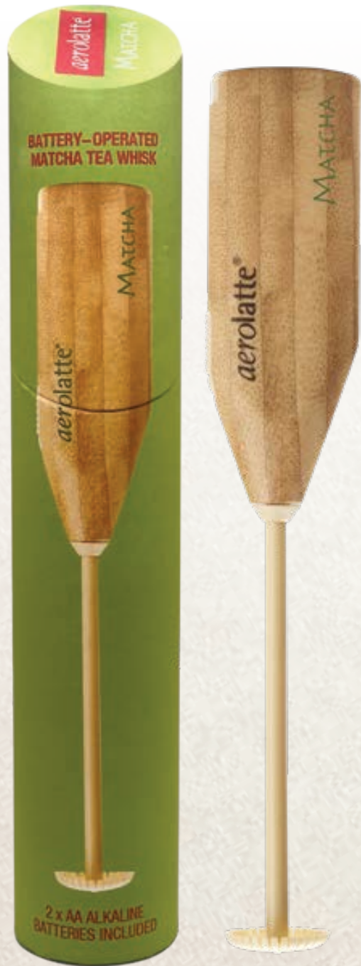
MATCHA TEA FROTHER AM-1-BM