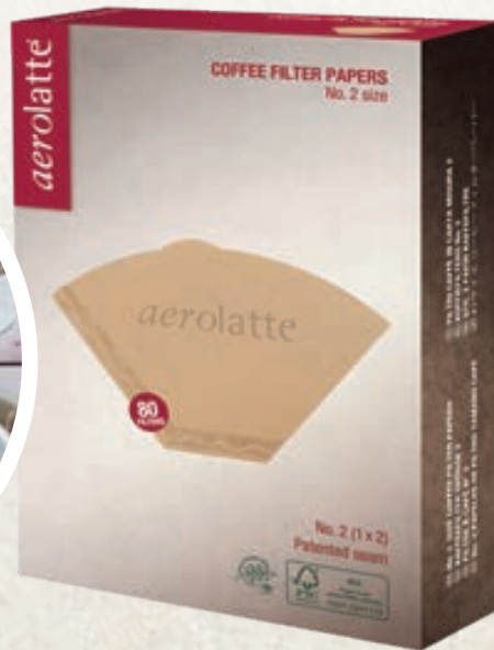
NO 2 COFFEE FILTER PAPERS CFP-1-2U