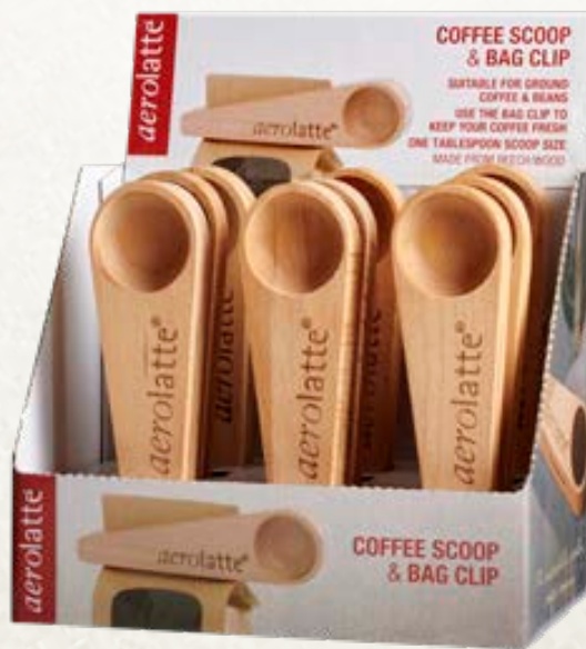
MEASURING SPOON AND CLIP CDU OF 12