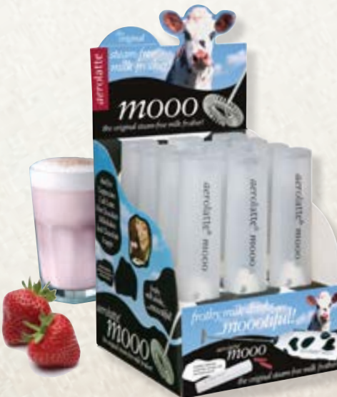
COUNTER DISPLAY OF 12