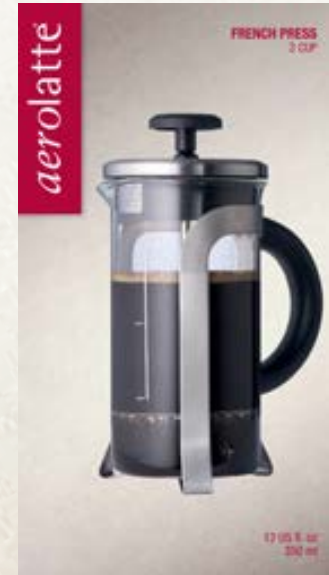
3-CUP FRENCH PRESS/CAFETIERE FP-1-3