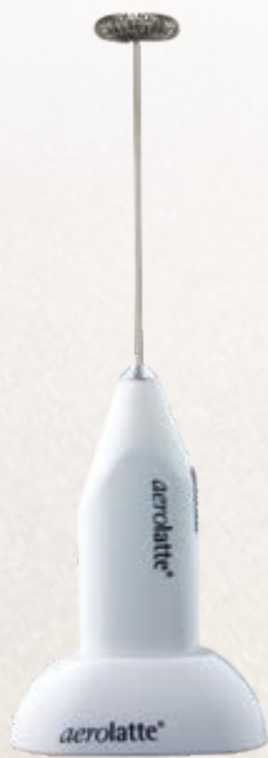
AL-ST4-WH GIFT BOX COUNTER DISPLAY OF 6