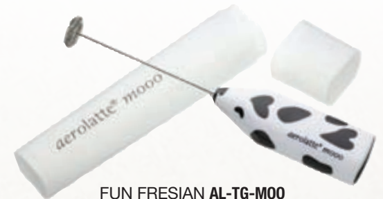
FUN FRESIAN AL-TG-MOO & PROTECTIVE TUBE