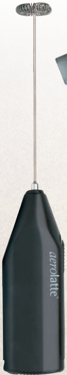
FUNCTIONAL BLACK AL-TG-BK