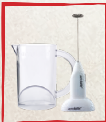
MICROWAVE FROTHING JUG AND WHITE FROTHER IN STAND