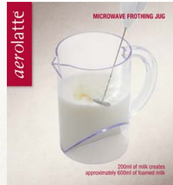
MICROWAVE FROTHING JUG FJ-1-CL