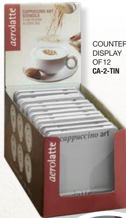
COUNTER DISPLAY OF 12 CA-2-TIN