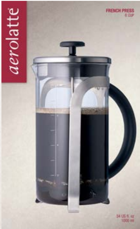
8-CUP FRENCH PRESS/CAFETIERE FP-2-8