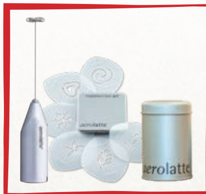
SATIN FROTHER, CAPPUCCINO ART AND SHAKER