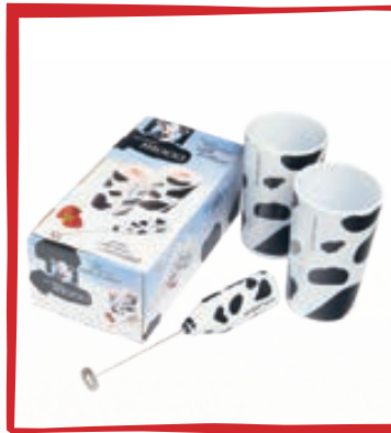
MOO GIFT SET