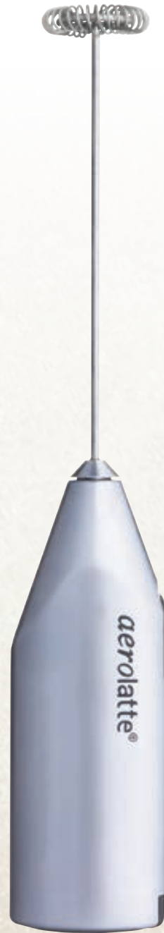
STYLISH SATIN AL-3-SAT