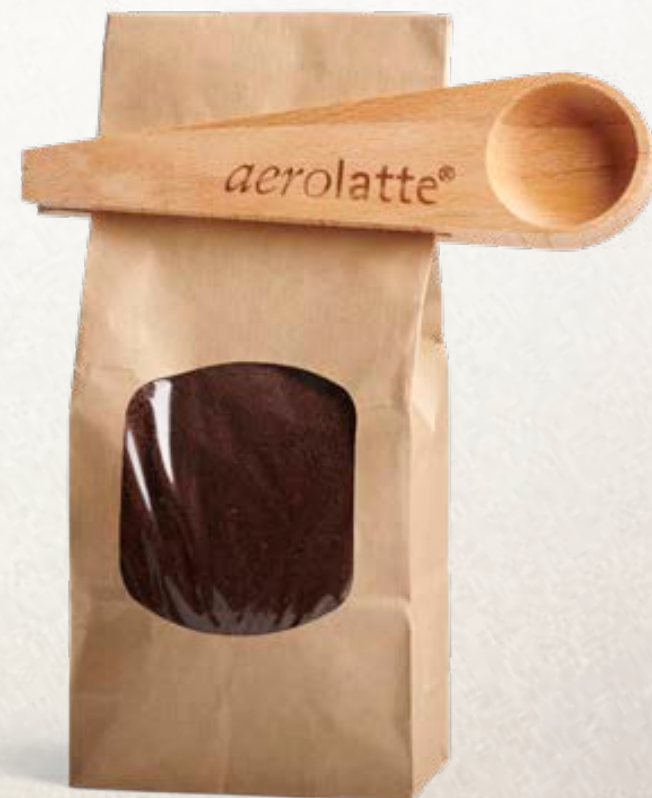
MEASURING SPOON AND CLIP CC-1-WD