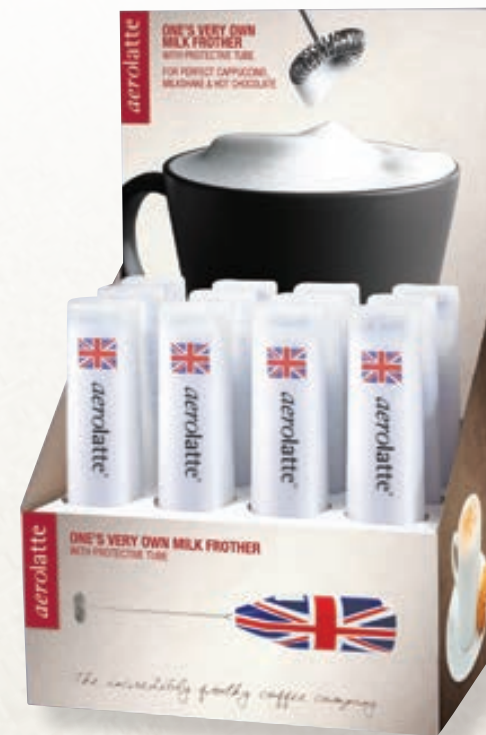
COUNTER DISPLAY OF 12