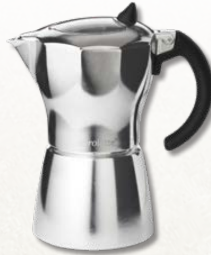
6-CUP MOKAVISTA MV-1-6AL