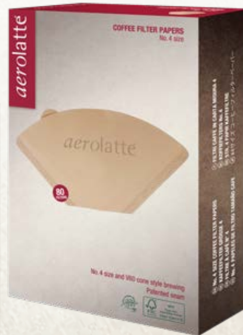
NO 4 COFFEE FILTER PAPERS MULTI MACHINE COMPATIBLE INC. HARIO V60 STYLE CONES CFP-1-4U