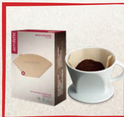
4 CUP CERAMIC FILTER AND NO 4 COFFEE FILTER PAPERS