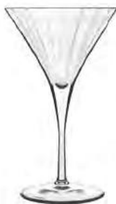
C 437 MARTINI 26 CL - 8 ¾ OZ H 18,5 CM - 7 ¼" MAX Ø 11,3 CM - 4 ½" 10951/01 • GP4/16