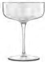
C 479 JAZZ COCKTAIL COUPE

30 CL - 10 1/4 OZ H 14.2 CM - 5 5/8" Ø 10.5 CM - 4 1/8"