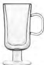
RM 491 IRISH COFFEE

14,5 CL - 5 OZ H 9,2 CM - 3 5/8" MAX Ø 6,8 CM - 2 5/8" 11862/01 • GP2/12