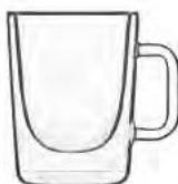
RM 401 CAFFÈ AROMA AROMA COFFEE

34 CL - 11 1/2 OZ H 15 CM - 6" MAX Ø 8,96 CM - 3 1/2" 10355/01 • GP2/12