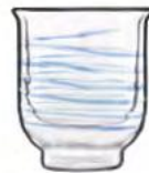
RM 509 ASAGAO TEA CUP 23.5 CL - 8 OZ H 9.7 CM - 3 7/8" Ø 8.8 CM - 3 1/2" 12810/01 • GP2/12