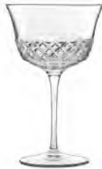
C 510 FIZZ

26 CL - 8 3/4 OZ H 15.7 CM - 6 1/8" Ø 9.6 CM - 3 3/4"