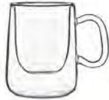
RM 385 JAMAICA TAZZINE CAFFÈ MONORIGINE SINGLE ORIGIN COFFEE CUP 9 CL - 3 OZ H 8 CM - 3 1/4" MAX Ø 6,2 CM - 2 1/4" 10663/01 • GP2/12