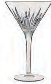
C 211 MARTINI

21.5 CL - 7 1/4 OZ H 17.2 - 6 1/3" Ø 10.4 CM - 4 1/8"