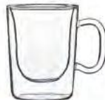
RM 383 ETIOPIA TAZZINE CAFFÈ MONORIGINE SINGLE ORIGIN COFFEE CUP 8,5 CL - 2 3/4 OZ H 8 CM - 3 1/4" MAX Ø 6,2 CM - 2 1/4" 10661/01 • GP2/12