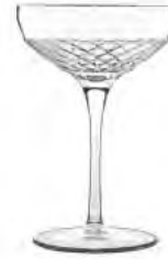
C 512 COCKTAIL COUPE

30 CL - 10 1/4 OZ H 15 CM - 5 7/8" Ø 11.3 CM - 4 1/2"