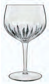
C 493 SPANISH GIN & TONIC

80 CL - 27 OZ H 20.5 CM - 8 1/8" Ø 11.9 CM - 4 5/8"