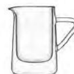
RM 466 LATTIERA CREAMER

30 CL - 10 1/4 OZ H 10,9 CM - 4 1/4" MAX Ø 10,6 CM - 4 1/4" 10355/01 • GP2/12