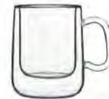
RM 386 COLOMBIA TAZZINE CAFFÈ MONORIGINE SINGLE ORIGIN COFFEE CUP 10 CL - 3 1/2 OZ H 8 CM - 3 1/4" MAX Ø 6,2 CM - 2 1/4" 10664/01 • GP2/12