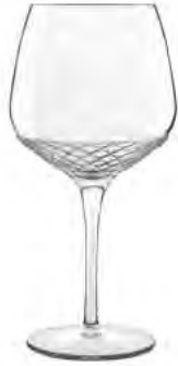
C 512 GIN GLASS

80.5 CL - 27 1/4 OZ H 23.5 CM - 9 1/8" Ø 11.4 CM - 4 1/2"