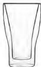
RM 376 LATTE MACCHIATO

34 CL - 11 1/2 OZ H 15 CM - 6" MAX Ø 8,96 CM - 3 1/2" 10355/01 • GP2/12