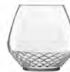
PM 1063 RUM

45 CL - 15 1/4 OZ H 9.2 CM - 3 5/8" Ø 9.8 CM - 3 7/8"