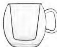
RM 402 CAFFÈ SUPREMO SUPREMO COFFEE

30 CL - 10 1/4 OZ H 11,5 CM - 4 1/2" MAX Ø 8,7 CM - 3 1/2" 10972/01 • GP2/12