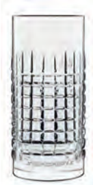
PM 1028 CHARME BIBITA/HI-BALL

48 CL - 16 1/4 OZ H 15.7 CM - 6 1/8" Ø 7.4 CM - 2 7/8"