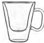
RM 388 COSTARICA TAZZINE CAFFÈ MONORIGINE SINGLE ORIGIN COFFEE CUP 8,5 CL - 2 3/4 OZ H 8 CM - 3 1/4" MAX Ø 6,8 CM - 2 3/4" 10666/01 • GP2/12