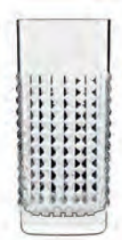
PM 1029 ELIXIR BIBITA/HI-BALL

48 CL - 16 1/4 OZ H 15.7 CM - 6 1/8" Ø 7.3 CM - 2 7/8"