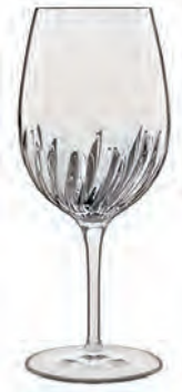
C 352 SPRITZ

57 CL - 20 OZ H 22.5 CM - 8 7/8" Ø 9.1 CM - 3 5/8"