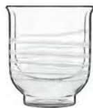
RM 509 SAKURA TEA CUP 23.5 CL - 8 OZ H 9.7 CM - 3 7/8" Ø 8.8 CM - 3 1/2" 12809/01 • GP2/12