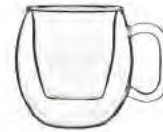
RM 388 BRASILE TAZZINE CAFFÈ MONORIGINE SINGLE ORIGIN COFFEE CUP 7,5 CL - 2 1/4 OZ H 7,1 CM - 2 3/4" MAX Ø 7,1 CM - 2 3/4" 10665/01 • GP2/12