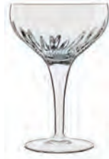
C 40 COCKTAIL

22.5 CL - 7 1/2 OZ H 14 CM - 5 1/2" Ø 9.5 CM - 3 3/4"